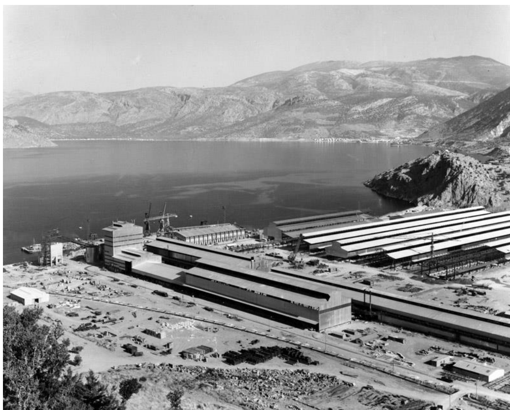
Figure 2. Aluminium of Greece, Saint-Nicolas plant, general view (1963-1966).